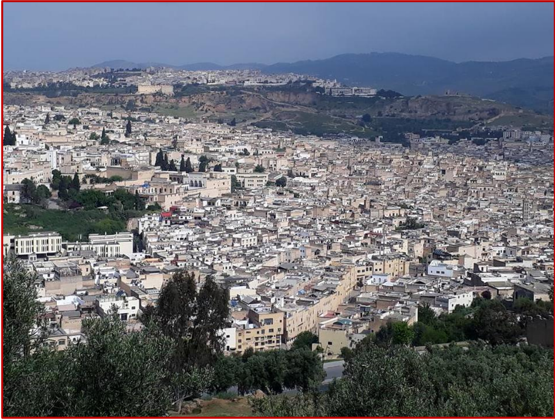
Moroccan city of Fez